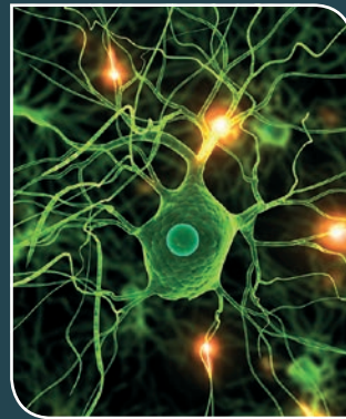
The usual activity of cells without Flashwave®

The acoustic waves initiate communication with and between the cells and activate an intrinsic repair program in the tissue. This cellular communication is the basis of a unique medical efficacy without relevant side effects.